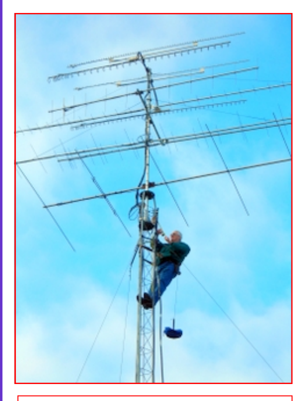
Ed, WA3BZT putting the finishing touches On the 7/8" hardlines for 2304 & 34356