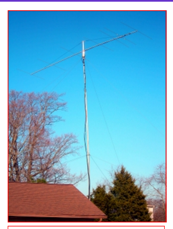
6M7JHV, 7 element 6M beam @ 42 ft