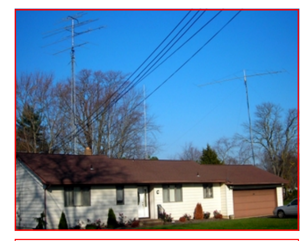
52 Ft Main fold-over tower (Left). 50-3456 MHz. 42 Ft tubular telescoping tower for 6 meters (Right)